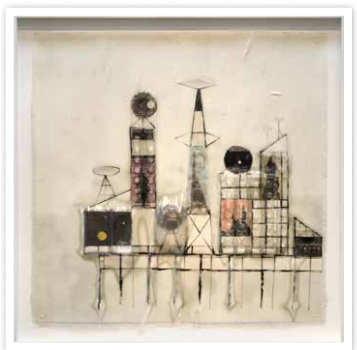
ABOVE LEFT: "Pier Two," 2014 — ink, acrylic, plastic, bio-resin, fiberglass on paper — courtesy of Shoshana Wayne Gallery ABOVE RIGHT: "Listening Platform," 2015 — ink, acrylic, plastic, bio-resin, fiberglass on paper — courtesy Shoshana Wayne Gallery.